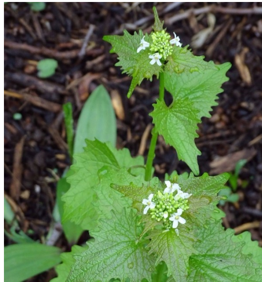
Garlic mustard plant and flowers

RSVP here: ninemilecreek.org/garlic-mustard-bust/