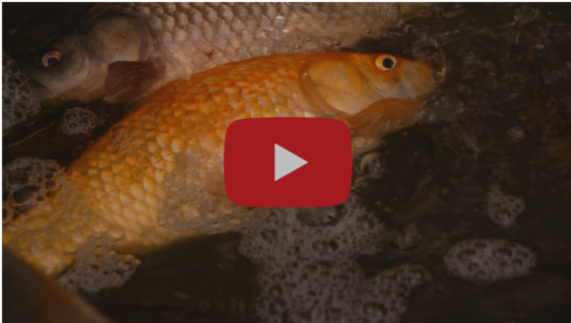
Minnesota Bound Episode: Goldfish Go Away!