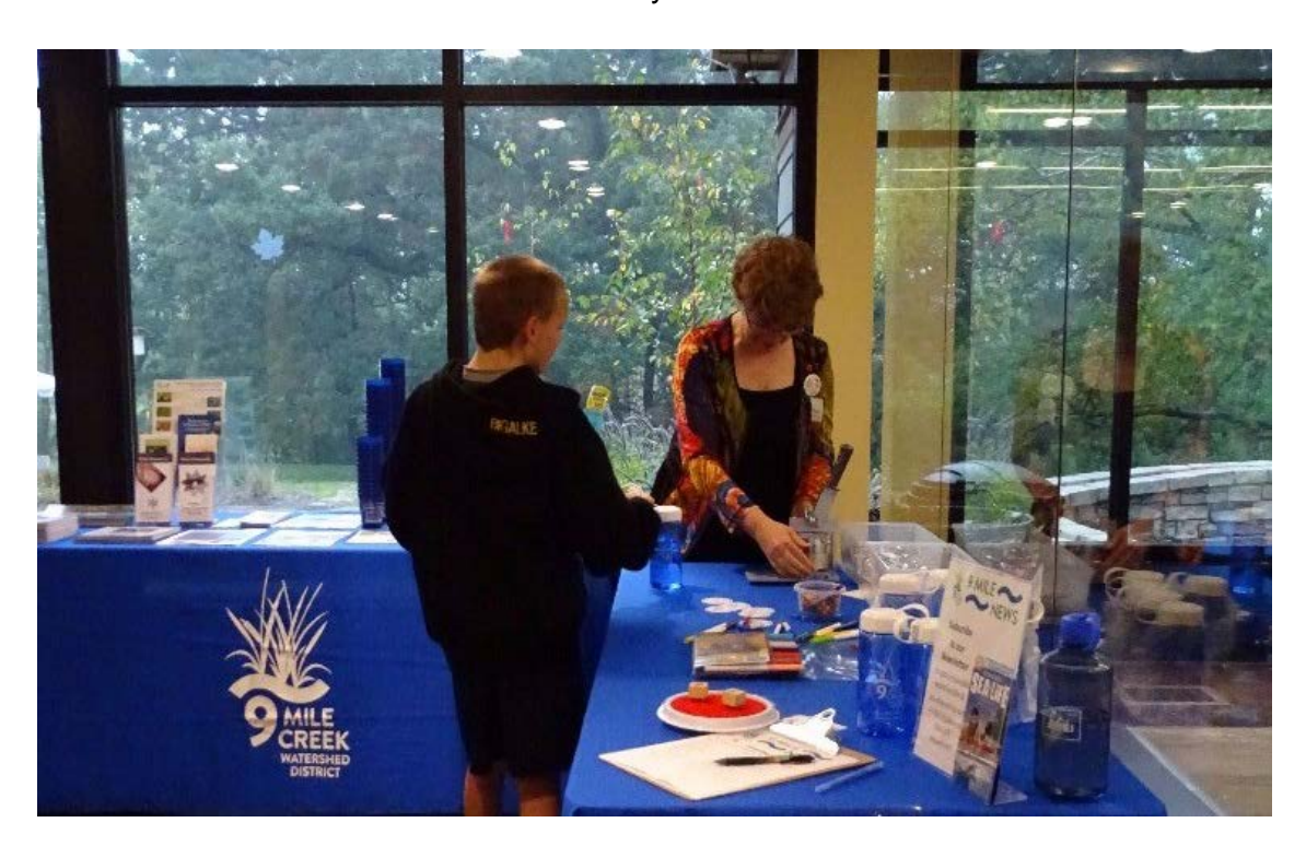
Tuesday, April 11 6:30-8:00 PM at Nine Mile Creek Discovery Point

Are you interested in volunteering for Nine Mile Creek? Come to a training on Tuesday, April 11 from 6:30-8:00 PM. You'll learn about what it means to be a watershed district volunteer and what opportunities there are to help in the watershed. We'll also discuss your ideas about volunteering.