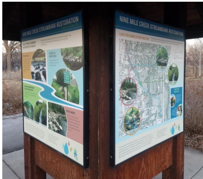
Two of three new signs for the streambank restoration project at Valley Park in Hopkins

The District updated and installed several interpretive signs in 2018, including new panels for the Hopkins streambank restoration at Valley Park, a new sign for the stormwater features at Harrison Park in Bloomington, a new headwaters sign at the North Fork of Nine Mile Creek in Hopkins, and a sign for a cost share restoration project in Minnetonka.