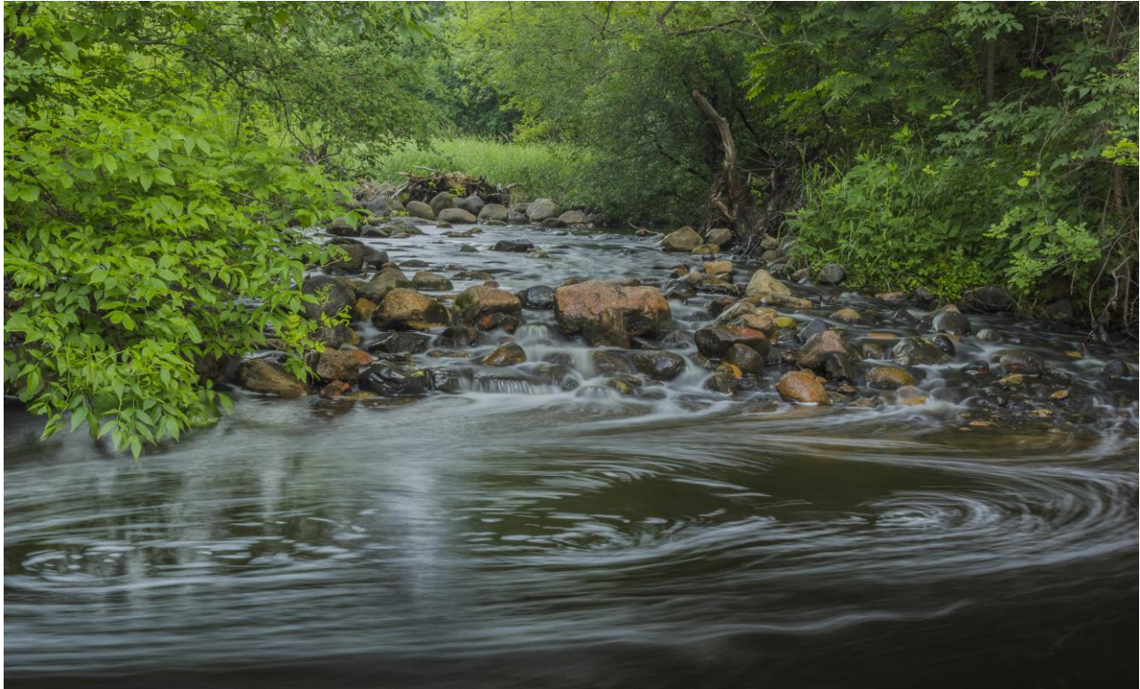
Nine Mile Creek