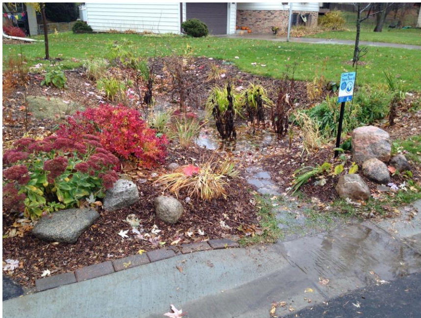
Residential raingarden in Bloomington installed with a 2018 cost share grant

Two (2) of the grants were specifically to reduce chloride loads to receiving water bodies. These grants included one for segmented plow blades and another for an anti-icing system.