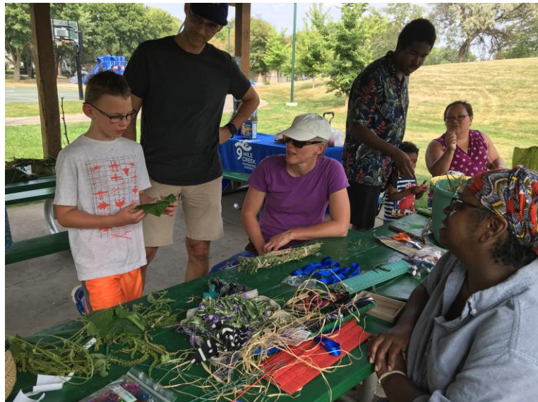
Tiny Boatmaking, a Summer Education Series event

District staff presented programs at seven schools around the watershed in 2018. Topics ranged from planting native flowers with kindergartners to water cycle lessons with fourth graders and topography investigations using the new watershed sandbox with fifth graders. The District also partnered with Hennepin County Riverwatch to monitor creek health with two high schools. Staff also gave a creek study program to a local Girl Scout troop. Over 700 students were reached in 2018.