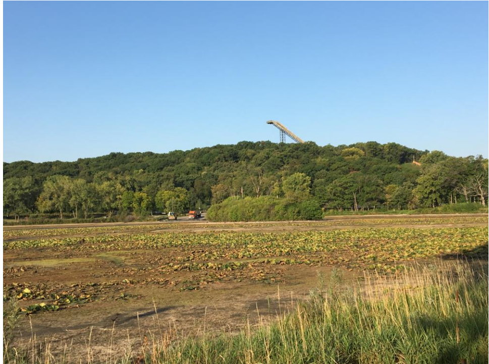
Normandale Lake during the drawdown – September 17, 2018

In 2018, the Nine Mile Creek Watershed District Board of Manager's accepted the engineer's report for the Normandale Lake Water Quality Improvement Project and ordered the project. The report identified numerous lake management options as potential solutions to water quality and nuisance biota issues. These options included; (1) a lake drawdown, (2) an in-lake alum treatment, (3) herbicide treatment, (4) aquatic macrophyte harvesting, (5) oxygenation system. The treatments will target curly-leaf pondweed and phosphorus loading. In addition, the District completed a fish survey to determine the need for future management of in-lake carp populations. As a result, the District anticipates tagging carp in 2019 to better understand their movement for future population management. As part of the project update process, the District and City of Bloomington held two (2) community meetings to get feedback from residents and to update them on the anticipated project(s) and timeline, along with holding the public hearing for the project.