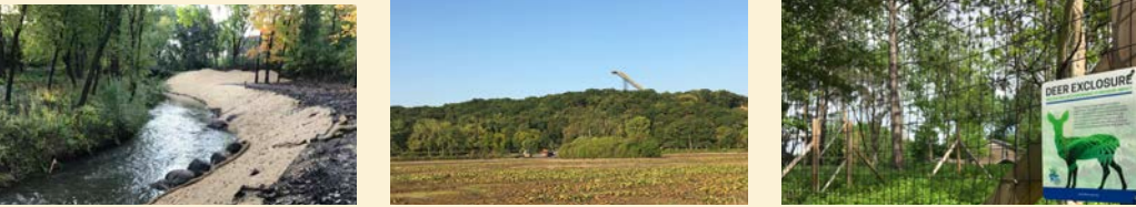
Left: Restoration work on Nine Mile Creek Middle: Normandale Lake drawdown Right: Deer enclosure structure in the restoration area

We continue to remove buckthorn, an invasive plant, at the District's five-acre office and educational facility in Eden Prairie. Native seeds, shrubs and trees were planted to replace the buckthorn, and the restored areas are growing in well.