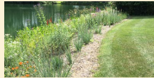
Left: Conducting a site visit at a nonprofit organization Right: Shoreline restoration installed with a cost share grant