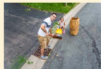
Top: Kids using the watershed sandbox Middle: Volunteer group "Stop Oversalting" Bottom: Residents keep stormdrains clean