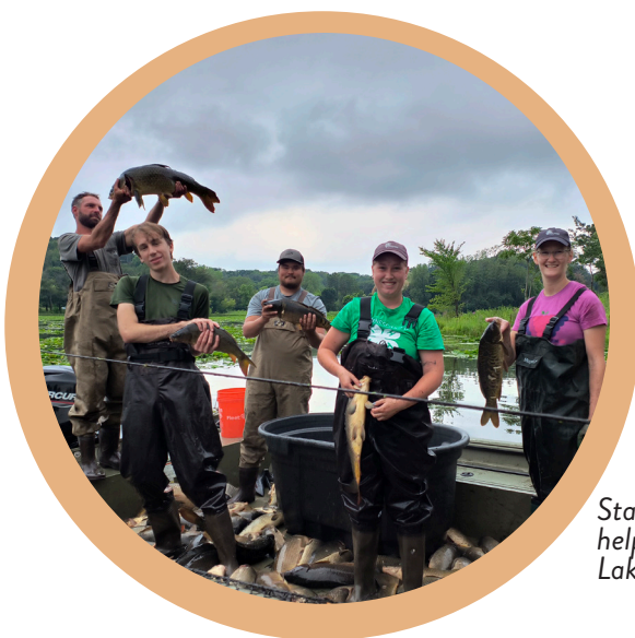
Staff, interns, and volunteers help remove carp at Normandale Lake in 2024.

BLOOMINGTON NINE MILE CREEK CORRIDOR RENEWAL PROJECT: NMCWD is partnering with the City of Bloomington on their Nine Mile Creek Corridor Renewal Project. The design team is assessing the stability of Nine Mile Creek, including streambanks, gullies, and wetlands, as well as considering upland restoration opportunities and improvements to Moir Park. Watershed staff assisted on development of the streambanks assessment scope and are providing expertise as it relates to the restoration design approach.