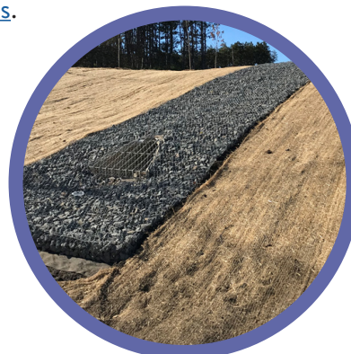
Adequate erosion control best practice on a recent permit inspection

Permitted work is regularly inspected by district staff to ensure compliance with permit conditions. If probable violations are found, permittees are typically notified in order to seek voluntary abatement or correction before resorting to formal legal action. In 2024, three notices of probable violations were issued.